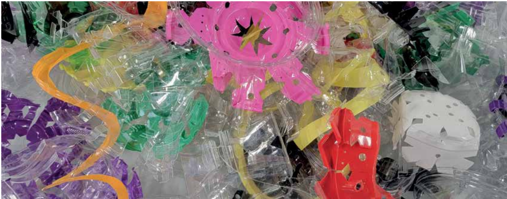
meld merge mix (installation detail) courtesy of Lisa Barthelson