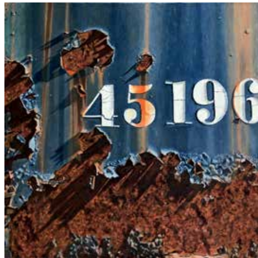
Dumpster 45196 , oil and encaustic on braced wood panel, 24" x 24", 2020