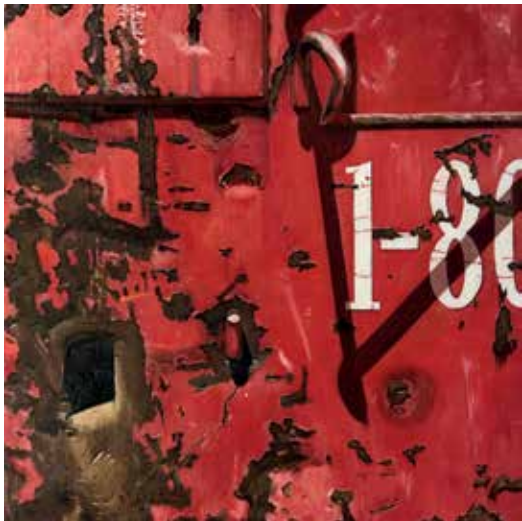
Dumpster 1-800 , oil and encaustic on braced wood panel, 24" x 24", 2019