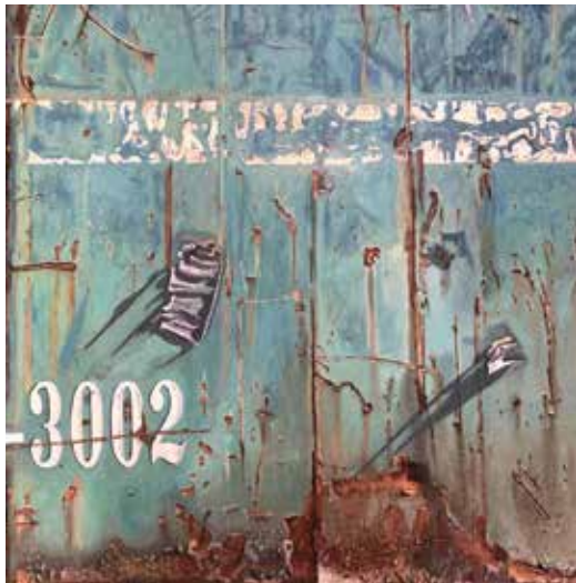
Dumpster 3002 , oil and encaustic on braced wood panel, 24" x 24", 2021