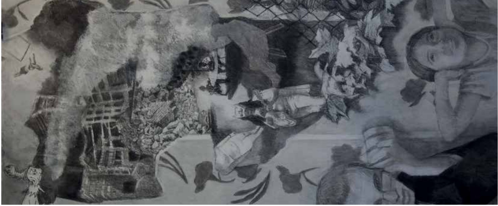
Listen to the Crumble (detail), charcoal, 4 panels, 60" x 42", 2021, $4,000